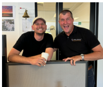
Visits from offsite team members.